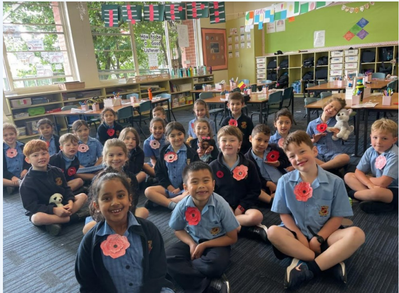
The students spent the day reflecting and learning about Remembrance Day through prayer, reading and art.. Picture Yr 1

At 11am on Thursday the 11th November the students and staff at St John's paused to honour those who sacrificed themselves for the freedoms we all enjoy to-