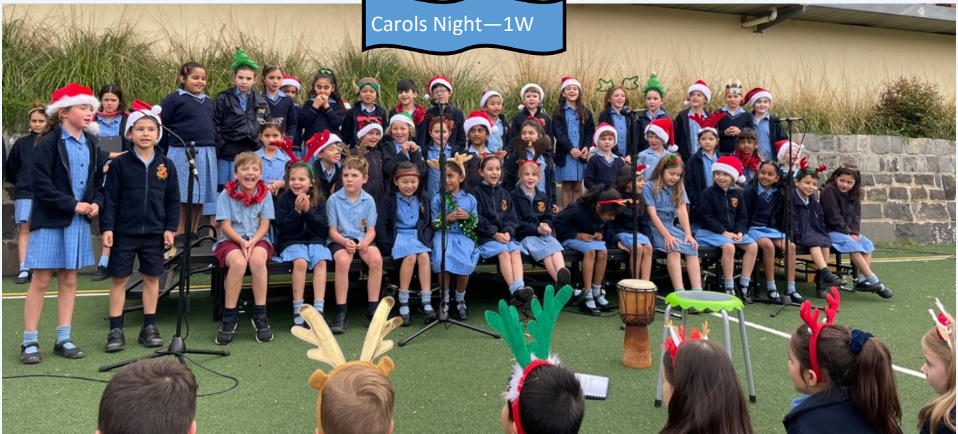
What a fabulous night it was on Tuesday 7 December where the St John's school community could finally gather together to enjoy the beautiful sounds of the children singing traditional Christmas Carols.